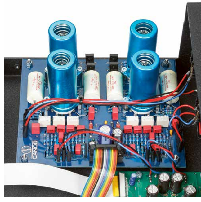
Four 6922 tubes form the symmetrical output stage of this exceptional player.