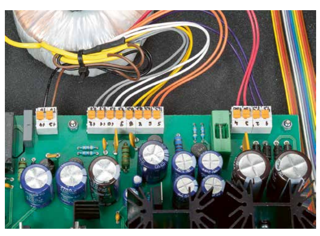
The opulent toroidal transformer is part of a sophisticated power supply system that careful tends to minimizing interference.

Whether it was Cara Dillon's wonderfully clear and expressive voice on "They Were Roses", Jim Keltner's bursting and extremely